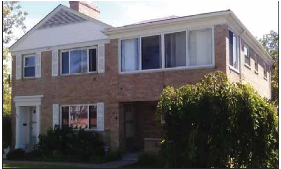
Residents will move from Wayland (far left) to a newer facility on Montgomery Road (above), which is more convenient to shopping and public transportation.

At both re-locations, all individuals and families are delighted with the new licensed homes.