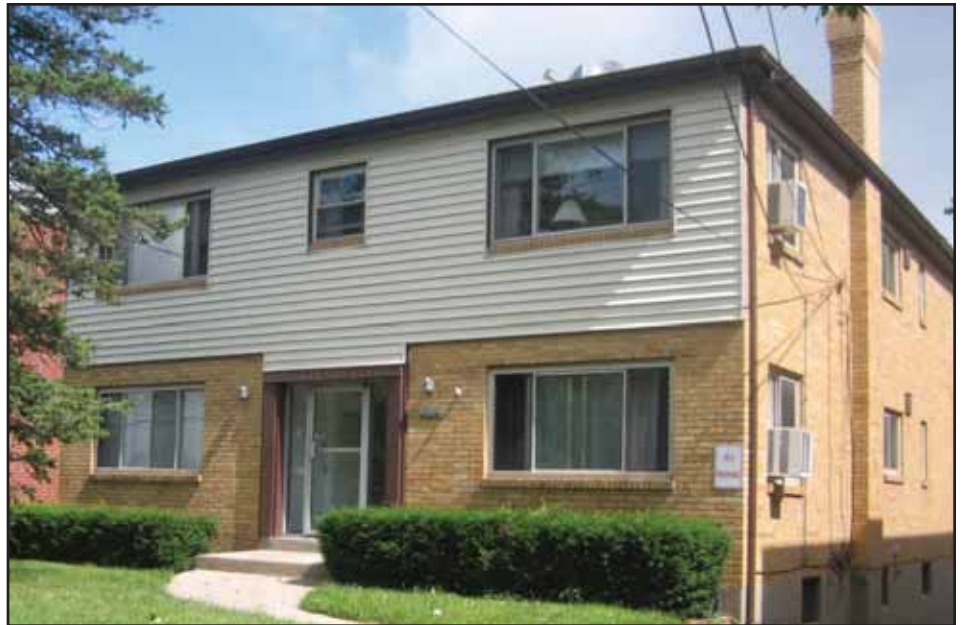
In August, residents moved to Longford in Sycamore Township (photo above) from Shadymist in Mount Airy (adjacent photo). The new location provides a more residential setting.